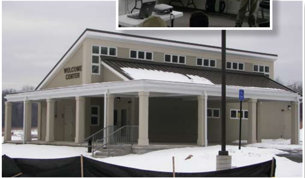
Lower Mount Bethel Township Welcome Center will host a variety of nature programs. Top: PPL's Fred Gast leads a nature program at the new community center.

Built with an environmentally friendly design, the center's "green" technologies incorporate solar panels, a living roof planted with sedum, and a stormwater system that allows roof drainage to return to groundwater. A rain garden within the parking area and a wetlands area adjacent to the