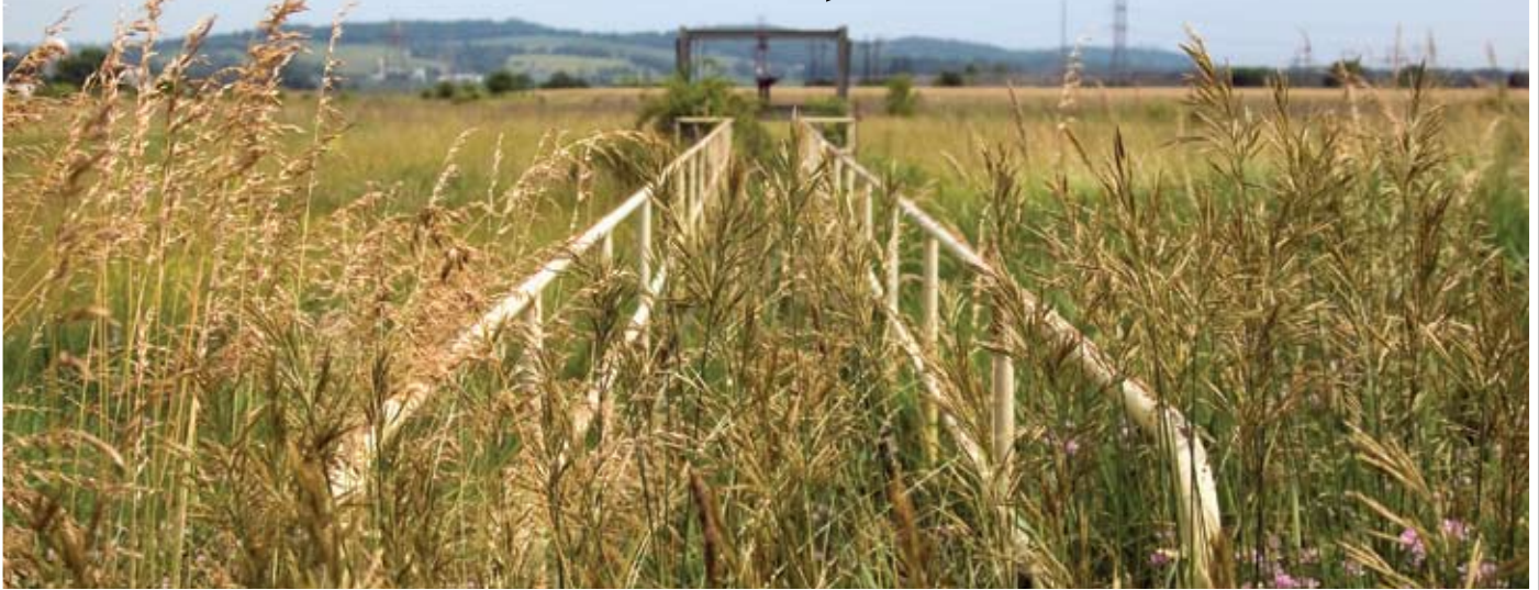
Grasses thrive on one of the retired ash basins at Martins Creek. Work is now under way to close Ash Basin No. 4.

As part of the safe, responsible decommissioning of the Martins Creek coal-fired power plant, PPL is closing Ash Basin No. 4 along DePues Ferry Road.