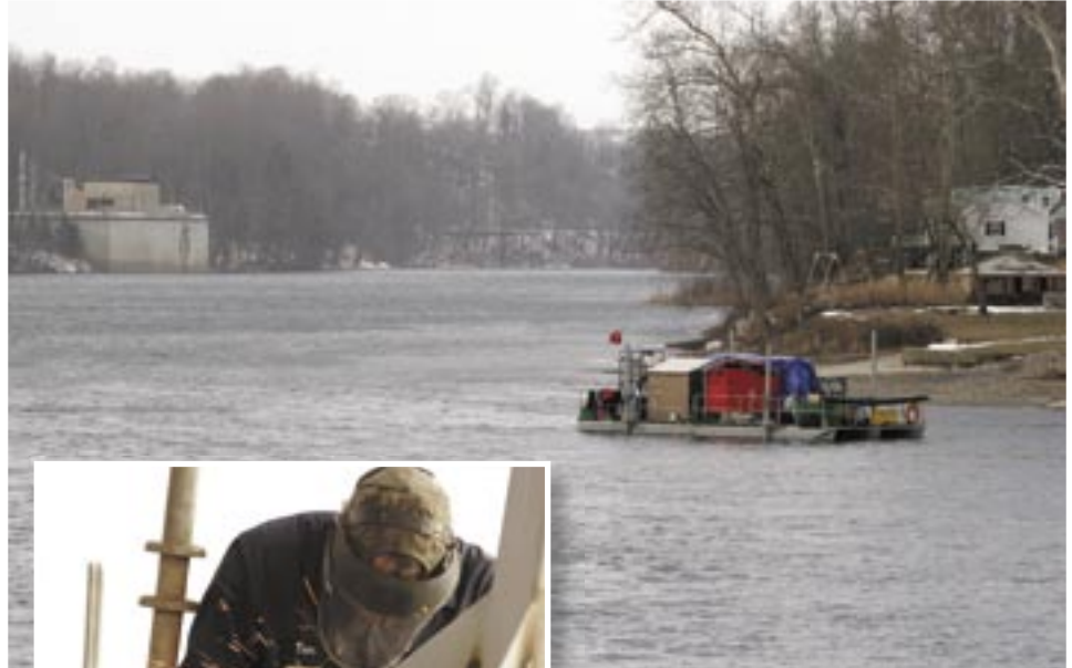
Above, divers have moved to the second area of ash to continue the cleanup. Left, a third dive platform is being constructed.

About three acres remain to be vacuumed. A third dive platform will begin operating in early January.