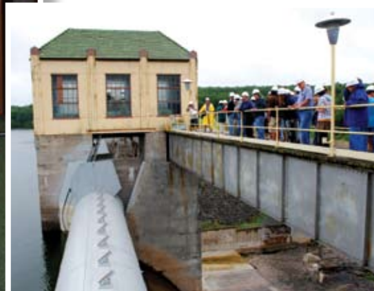
Visitors enjoyed tours of the dam and activities at the Environmental Learning Center during PPL's third annual Lake Wallenpaupack Open House.