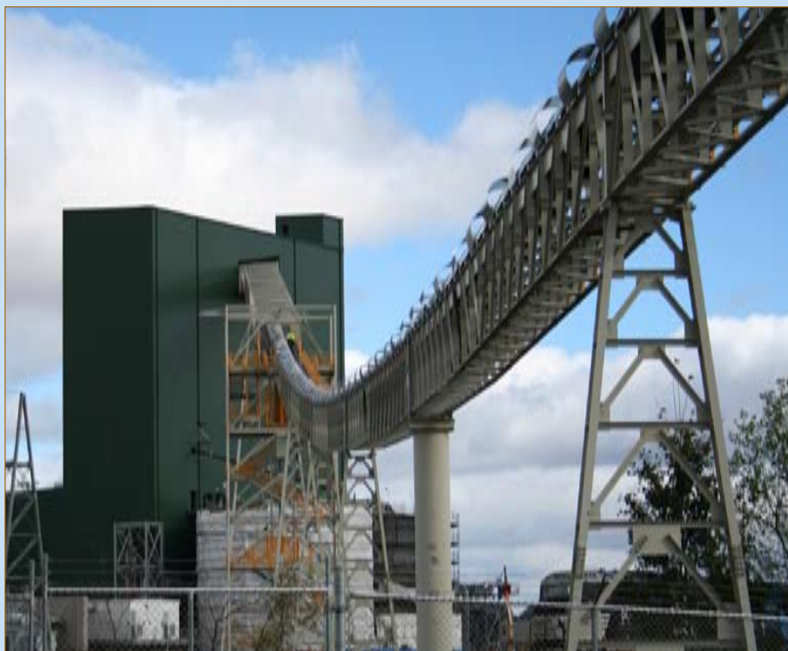
A new conveyor will bring limestone, a key ingredient in the scrubber process, to the power plant.

By 2010, all of PPL's major coal-fired generation units will have scrubber technology.